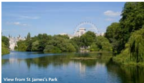
View from St James's Park