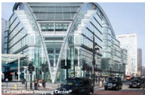
Cardinal Place Shopping Centre